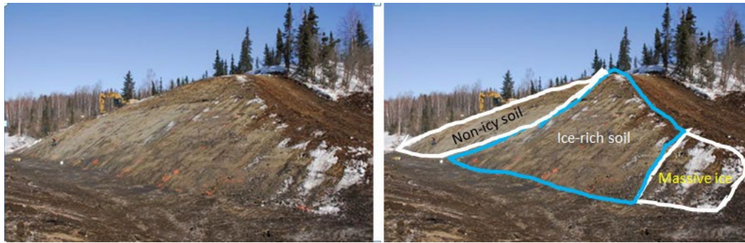
Three material types exposed in permafrost cut slope, prior to any thaw. (Dalton Highway example of surprises encountered when constructing a cut slope in icy materials)

Construction activities that affect permafrost include clearing vegetation, excavation of ditches, and side and through cuts. The duration of time excavations are exposed is an important factor, especially if excavation must occur during warm conditions. Construction during summer and fall increases the potential to permafrost thaw. Diverting and concentrating melt ice flow accelerates erosion, and silts and fine sands are more susceptible. When thawing, ice-rich permafrost experiences substantial reduction in strength due to high water content, lack of drainage, and consolidation, and can cause slope failure. Construction during winter is considerably more expensive.